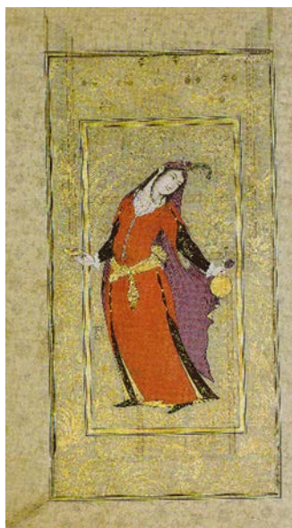
Fig. 1: A Picture of Women in Mongol Style of India

An important issue of them is, and the qualitative analysis of them back to the seventeenth century. This text of religion in many types of Indian art also manifests itself (Hosseini.1993.154) (See Fig 1).