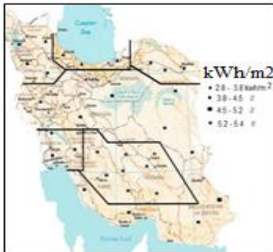
Figure 1: the amount of solar irradiation in Iran

in the highest ranks in regard of the solar energy reception in comparison to the various spots around the globe. The amount of solar energy irradiation in Iran has been estimated to be in a range between 1800 to 2200 kWh/m 2 per year and it is of course higher than the world's average. More than 280 sunny days have been reported for Iran on a yearly average and it is a very notable figure. Figure (1) illustrates the map of the solar irradiation and the various regions' enjoyment of this gift in Iran. Since one of the most important factors polluting the environment in the world and, particularly, in our country is the fossil fuels' consumption in residential, commercial, industrial and sport places for preparing hot water and heat in the living spaces, the implementation of the principles of the environmental stability can help us fight this problem and renewable solar energy can be one choice.