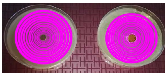
Figure 1. Diffusion of the “Black Soldier Fly Meal (BSFM) Cream” through nutrient agar medium.

-Figure below the standard deviation is the increase for calculated parameter and percent increase for the others over the control. *: P < 0.05 ; **: P < 0.005 ; ***: P < 0.01