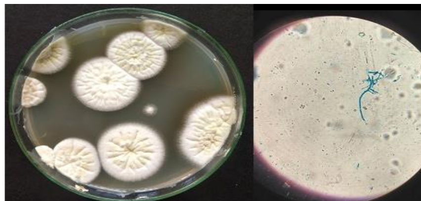
Figure 2. Micromorphological characters of Aspergillus flavus

generally less than 1 mm in length, located underneath the globose vesicles. Vesicles at a young are extended and later become globose, varying in length from 10 to 65 mm in diameter. The length of the primary branch is up to 10 mm, and the secondary up to 5 mm (Ruiqian et al. , 2004; Hedayati et al. , 2007).