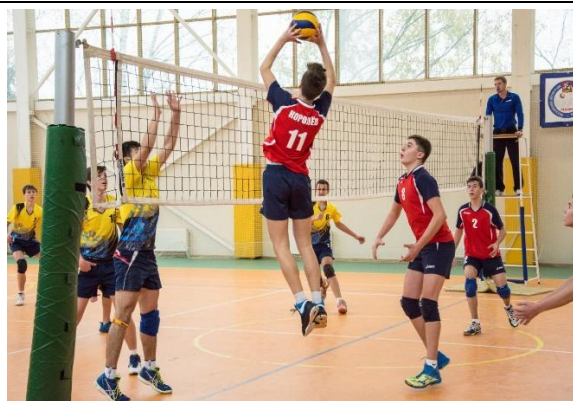
Figure 2. The process of volleyball training

For the general improvement of the whole organism in the work done, the young men who had initially poor physical fitness were provided with systematic volleyball training ( Figure 2 ).