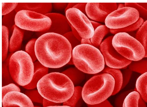
Figure 3. Normal red blood cells

In the case of systemic muscle training in the blood of initially physically untrained young men, a significant decrease in the content of erythrocytes with a disturbing shape and an increase in the number of erythrocytes with an optimal discoid shape for microcirculation were noted ( Figure 3 ).